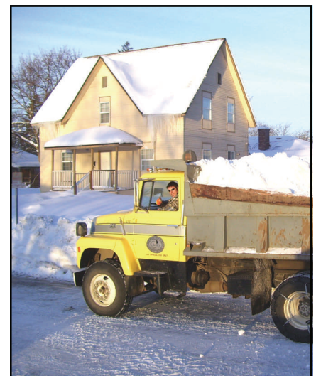
City crews had to use trucks to remove snow from the streets in 2007 because the plow berms had become too high.

When the weather gets cold, it's especially important to plan ahead when you leave for the holidays, to make sure your vehicle doesn't block city plows while you're gone. Please check the City of Cheney website for more information on winter parking restrictions at www.cityofcheney.org , "Laws & Regulations," "Snow Removal Policy."