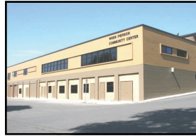
The lower level of the Wren on 3rd between C & D Streets.

The newly renovated Wren Pierson Community Center is truly a building to serve the whole Cheney community. Not only is the Wren home to outstanding city Parks and Recreation programs for residents of all ages, but it also serves a vital role in providing space for several high-demand community groups. These volunteer groups would face a major obstacle in providing their services without the Wren Pierson Community Center.